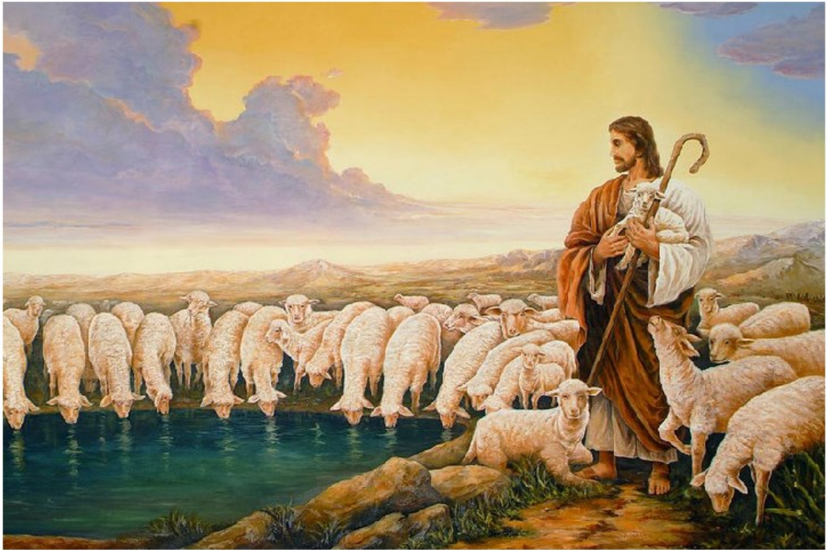
Jesus our Shepherd