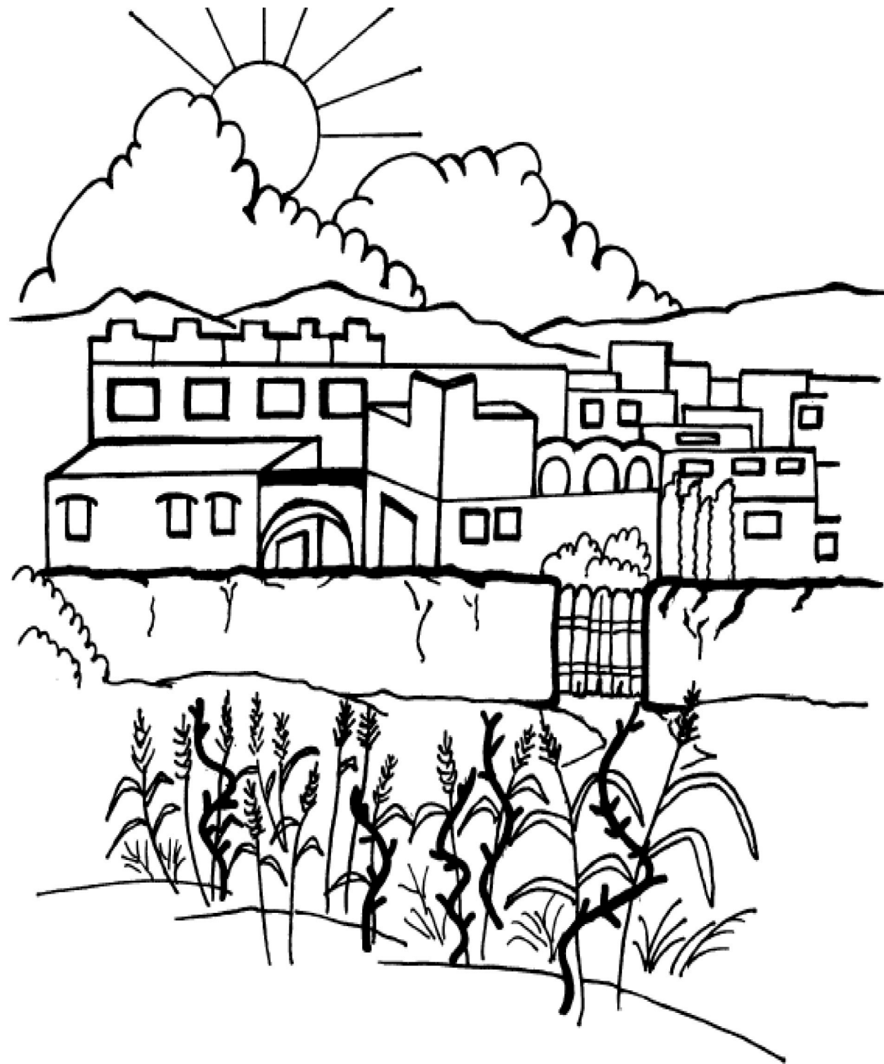
"Jesus told His disciples a parable about wheat and tares." Matthew 13:24 - 30, 36 - 43

L A K E O F F I R E B M C T S C P S A T A N F S Q Q A F E I A A R Q T B O U L U B G C I O S E F I L F O K O O B O F N M T O B G S S W S Z W N G A W D B W E O N O A A A D A F L D E E E L G B K N I D N I Y S T S V T O B P L N E N R D R E I A I E V M Y W A H E T F L P Z E E P E B P T T O I B S P R C L C C D E H F I H T A E D O G E E V C A Z I O D C T S F P F R D T I S I W N B D T Z S H M C N S T T C K S K C L I T E T O V B Y I H A D E S E L B T O W